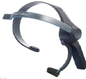
Figure. 2. Mind wave mobile