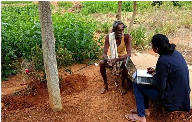
Figure 4. sample collection by Asking PHQ-9